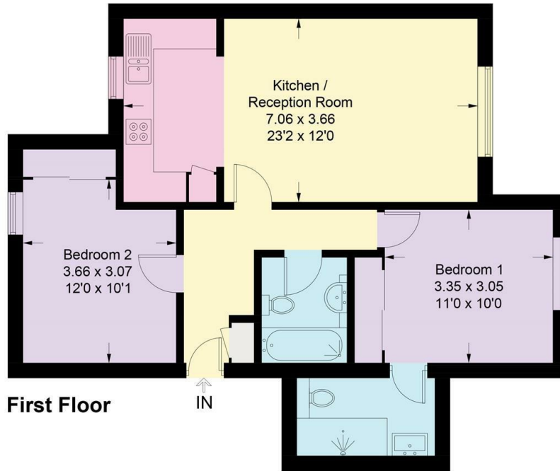
Illustration for identification purposes only, measurements are approximate, not to scale. (ID1158289)